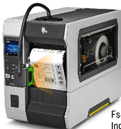
Fs40 Fixed Industrial Scanner (Higher Inspection Speeds)