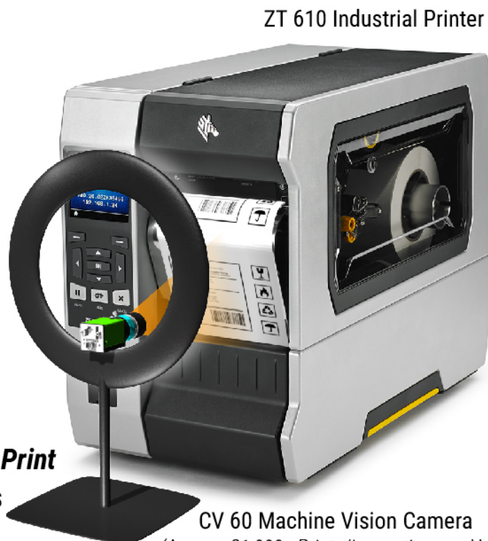
ZT 610 Industrial Printer