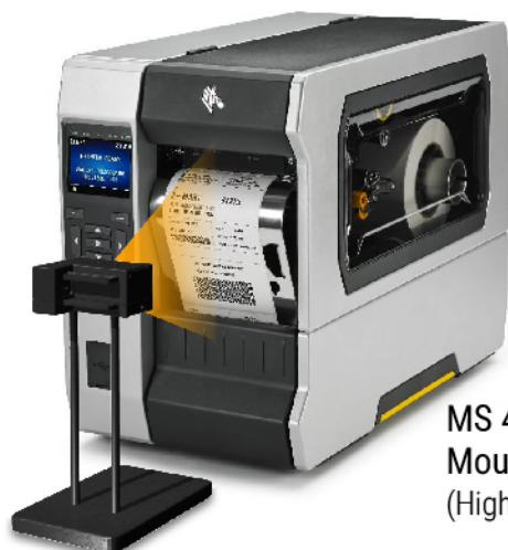
MS 47 Series Fixed Mount Imager (Highly Cost Effective)